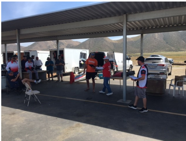
Winners receiving award recognition