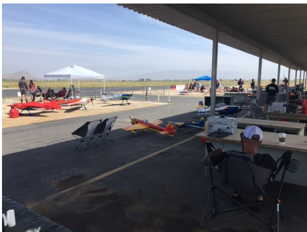
The event competition and judging stands.