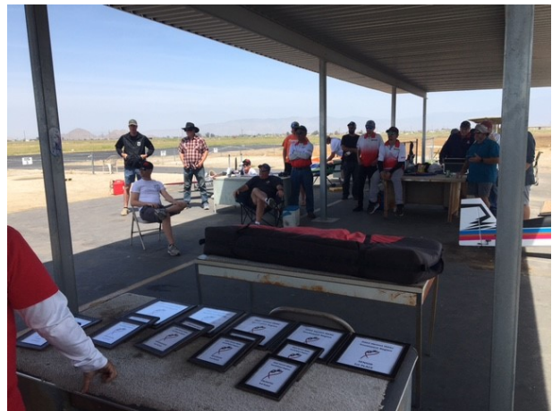
The awards table.