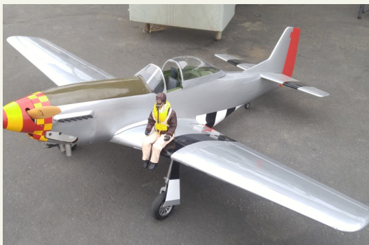
Paul Kopp's New Bird...looks and flies great

On May 24, 2018 some of the HMM members from down south (San Diego) spent the day flying turbines, some very beautiful aircraft.